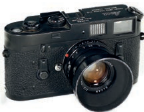
Leica »Camera Still Picture KE-7A« Very rare black 'M4' produced in Canada in mini-series for US-Army only. (€ 18.000 – 30.000 / US$ 24,000 – 40,000)