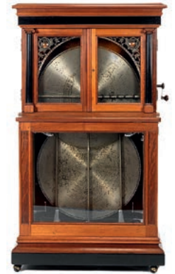
»Regina Style 33« Automatic Disc- Changing Musical Box for 12 Discs Extremely rare in this superb condition. (€ 22.000 – 25.000 / US$ 30,000 – 34,000)