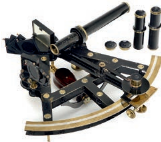
English Double-Frame Sextant, c. 1850 Signed: "C. W. Dixey". (€ 1.000 – 2.000 / US$ 1,400 – 2,700)