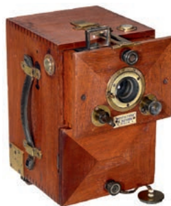
»Suter's Magazine Detective Camera«, c. 1893 Very rare and early model with folding viewfinder. (€ 1.500 – 2.000 / US$ 2,000 – 2,700)