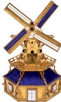
Superb Silver-Gilt and Enamel Musical Windmill Automaton, early 20th Century (€ 8,000 – 12.000 / US$ / 11,000 – 16,000)