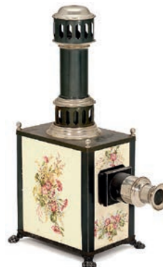
Ceramic Magic Lantern »Luna«, c. 1895 Excellent condition and extremely rare! (€ 2.000 – 3.000 / US$ 2,700 – 4,000)