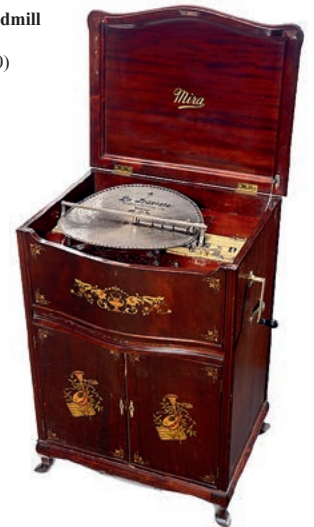
Console Disk Musical Box »Mira«, c. 1900 By Mermod Frères, Switzerland, (47 cm / 18 ½ in.). With 20 discs. – Superb original transfer-decorated cabinet finish! (€ 6.000 – 8.000 / US$ 8,000 – 11,000)