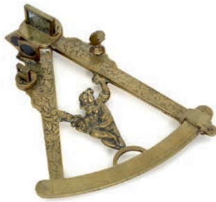
Early German Brass Octant, c. 1760 By Jan Cornelius von Voer. Rare! (€ 2.500 – 3.500 / US$ 3,400 – 4,800)