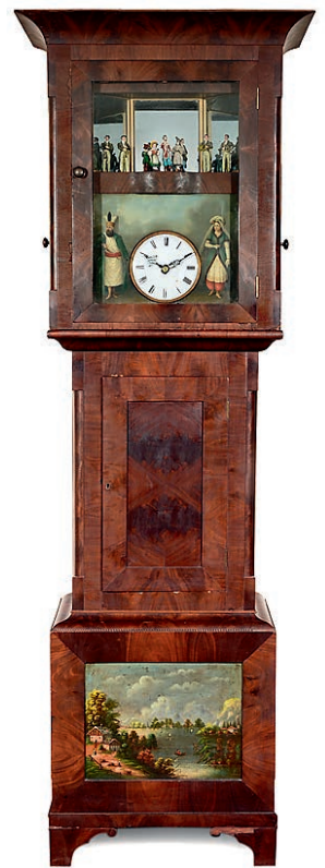
Black Forest Flute Clock with Automata, c. 1840 (€ 10.000 – 15.000 / US$ 13,600 - 20,400)