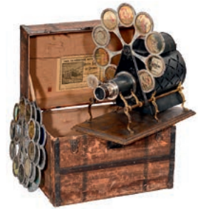
Magic Lantern Outfit »Pettibone Sciopticon ('The Peacock')«, c. 1890 With original trunk and 37 hand-coloured slides in 4 rotating holders! (€ 2.800 – 4.500 / US$ 3,800 – 6,000)