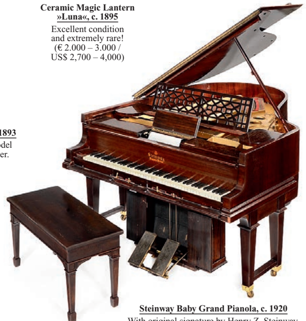
Steinway Baby Grand Pianola, c. 1920 With original signature by Henry Z. Steinway, the last Steinway in the management. (€ 15.000 – 18.000 / US$ 20,400 – 24,500)