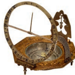
Augsburg-Type Equinoctial Compass-Sundial by Andreas Vogler, c. 1780 (€ 1.000 – 2.000 / US$ 1,400 – 2,700)