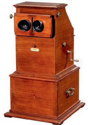
Stereo Viewer »Astra (6 x 13 cm)«

Cylinder width 25 2/3 in (65cm) In excellent restored condition. (€ 30.000 – 45.000 / US$ 40,000 – 60,000)