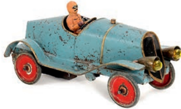
Large French Delahaye Roadster by »Pinard«, c. 1935 Good original condition. (€ 2.500 – 3.000 / US$ 3,400 – 4,000)