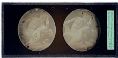
»Stereo-Daguerrotype by S. Marchi«, c. 1855 (€ 1.000 – 1.500 / US$ 1,350 – 2,000)