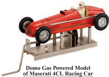
Domo Gas Powered Model of Maserati 4CL Racing Car Original driver's figure with china porcelain head. (€ 12.000 – 16.000 / US$ 16,000 – 22,000)