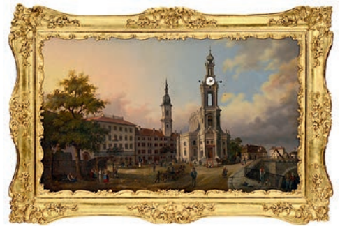
Viennese Musical Picture Clock, c. 1870s

Impressive German tin toy from early Nuremberg production! (€ 5.000 – 7.000 / US$ 6,800 – 9,500)