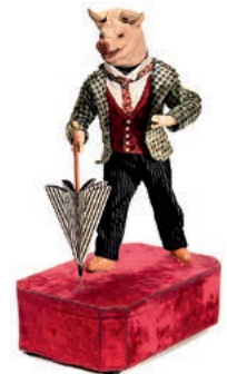
Rare Decamps »Gentleman Pig« Automaton, c. 1915 The only example that we have seen to date. (€ 9.000 – 12.000 / US$ 12,200 – 16,300)