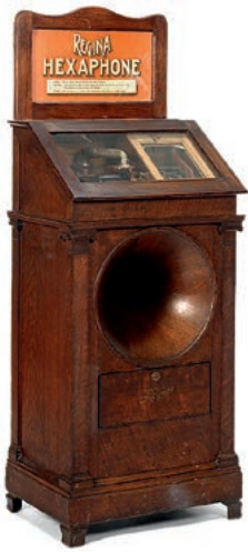
Coin-Operated »Regina Hexaphone« Phonograph, c. 1915 Excellent and complete working condition! (€ 8.000 – 10.000 / US$ 11,000 – 14,000)