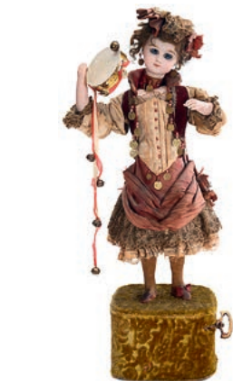
Éspanole Automaton by Lambert, c. 1885

With Jumeau head, in original costume. (€ 3.800 – 4.500 / US$ 5,000 – 6,000)