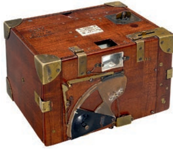
»Luzo«, 1896 The 1st English Rollfilm Detective Camera. (€ 1.500 – 2.000 / US$ 2,000 – 2,700)