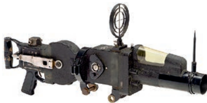
Japanese 35mm Machine Gun Camera »Roknoh-Sha«, c. 1933 Pre World War II – With original box and many accessories. (€ 2.500 – 4.000 / US$ 3,500 – 5,500)