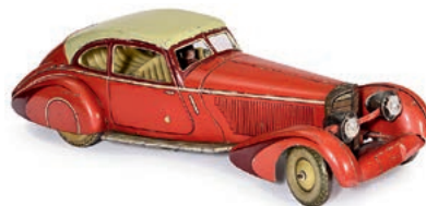
Tipp & Co Motorway Courier No. 992/7, 1936 (€ 2.500 – 3.500 / US$ 3,400 – 4,800)