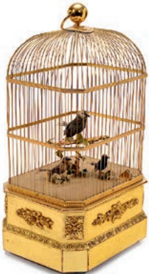
Coin-activated Triple Singing Bird Automaton by Reuge, c. 1940s

Excellent interactive exhibition piece. (€ 1.500 – 2.000 / US$ 2,000 – 2,700)