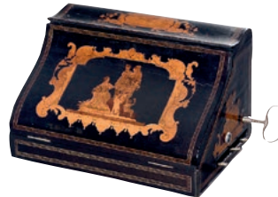
Early Signed Fusee Cylinder Musical Box by Ducommun-Girod, in Inlaid Escritoire, c. 1820 Important historical document for the development of the Swiss musical box. (€ 4.000 – 6.000 / US$ 5,000 – 8,000)