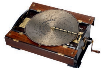
Folding-Top »Emerald' Polyphon Nr. 49c« with Bells, c. 1900 In just perfect condition. (€ 20.000 – 30.000 / US$ 27,000 – 40,000)