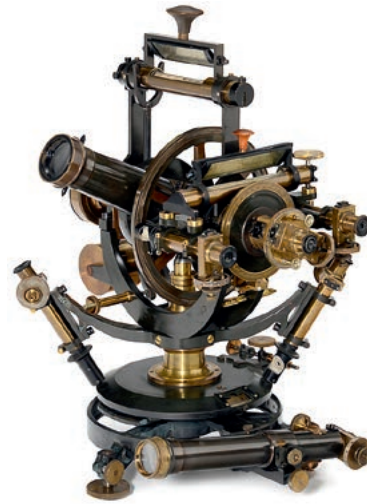
Theodolite by Hildebrand, c. 1890 (€ 3.000 – 5.000 / US$ 4,000 – 6,800)