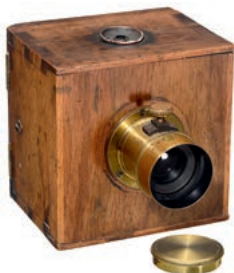
»Photographie de Poche 'Dubroni' No. 2«, 1865 A fantastic milestone: the world's 1st instant camera! (€ 1.800 – 2.200 / US$ 2,400 – 3,000)