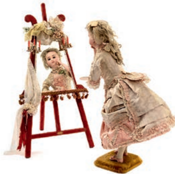
Coquette Musical Automaton by Gustave Vichy, c. 1885 (€ 12,000 – 16,000 / US$ 16,300 – 21,800)

Excellent interactive exhibition piece. (€ 1.500 – 2.000 / US$ 2,000 – 2,700)