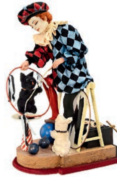
Contemporary Automaton by Michel Bertrand: 'Dresseur des Chien' After an original Vichy design. (€ 12.000 – 15.000 / US$ 16,000 – 20,000)