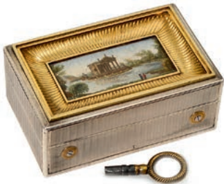
Early Parisian Silver-Gilt Musical Box with Neoclassical Micro-Mosaic Lid, c. 1840s With rare Parisian guarantee stamp. (€ 18.000 – 22.000 / US$ 24,000 – 30,000)