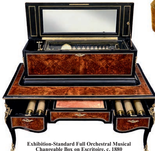
Exhibition-Standard Full Orchestral Musical Changeable Box on Escritoire, c. 1880

With Jumeau head, in original costume. (€ 3.800 – 4.500 / US$ 5,000 – 6,000)