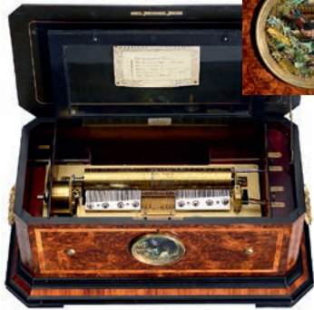
Rare »Piece à Oiseaux« Musical Box by Ami Rivenc, c. 1870

With 16-note organ for birdsong, automaton bird in glazed "bower". Wonderful operatic repertoire! (€ 18.000 – 25.000 / US$ 24,000 – 33,000)