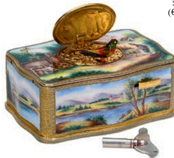
Contemporary Enameled Bronze Singing Bird Box, stamped »EB« (€ 2.000 – 3.500 / US$ 2,700 – 4,500)