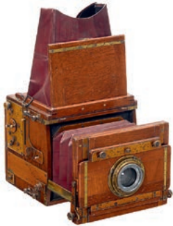
»Soho Tropical Reflex«, c. 1906 By Marion & Co, London. Very attractive (€ 2.000 – 3.000 / US$ 2,700 – 4,000)