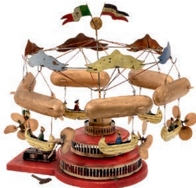
Airship Carousel by »Müller & Kadeder«, 1909

With 16-note organ for birdsong, automaton bird in glazed "bower". Wonderful operatic repertoire! (€ 18.000 – 25.000 / US$ 24,000 – 33,000)