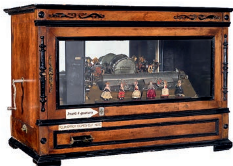
Swiss Station Musical Box, c. 1890 Superb interchangeable coin-operated instrument with 3 cylinders, Mandarin automata, dancing dolls, drum and candy dispenser! (€ 20.000 – 30.000 / US$ 27,000 – 40,000)