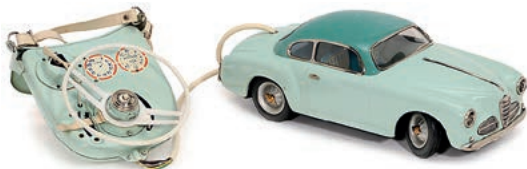
Ventura Alfa Romeo 1900 SS with Remote Control Superb condition! Extremely rare! (€ 9.000 – 11.000 / US$ 12,000 – 15,000)