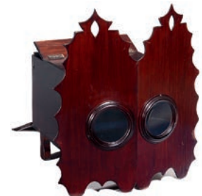
Spanish Peep-Show for 2 Viewers, c. 1850s

Extremely rare, one of only two known worldwide! (€ 1.700–2.500 / US$ 2,300–3,300)