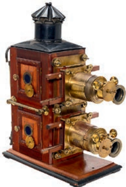
Biennial Magic Lantern, c. 1880s Very attractive and useable. (€ 2.600 – 3.500 / US$ 3,500 – 4,800)