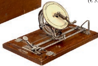
»Discret«, 1899 One of the most attractive typewriters. (€ 5.000 – 8.000 / US$ 6,800 – 11,000)