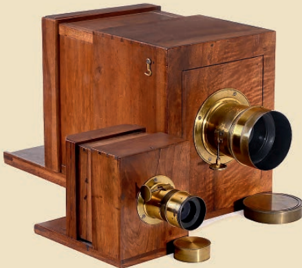
Wetplate Sliding Box Camera with Lerebours et Secretan Lens, c. 1855