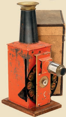
Kinematador No. 788, c. 1900