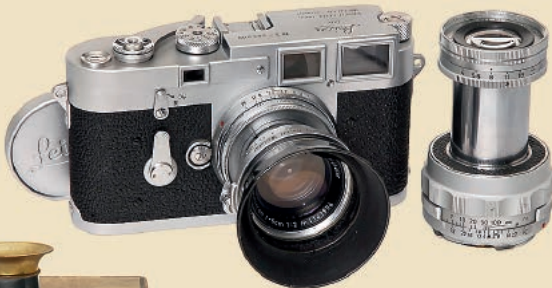
»Leica M3«, double-stroke, No. 703200