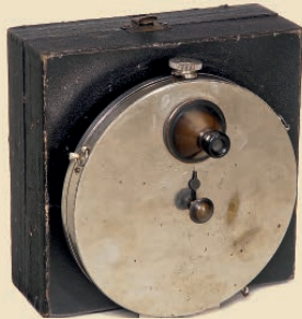
Stirn's Concealed Vest Camera No. 1, 1886