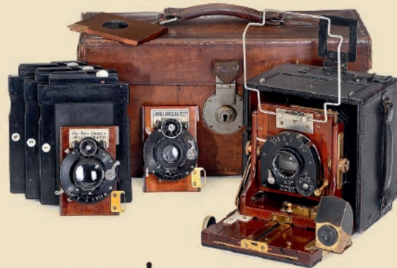
Una Camera Outfit