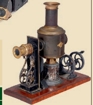
Kinematador No. 790 by Ernst Plank, 1897