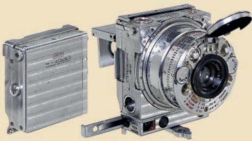
Compass II, 1938