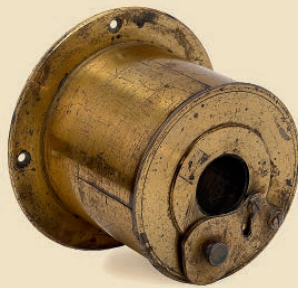
Daguerreotype Lens with Construction Features of Susse Frères, c. 1839