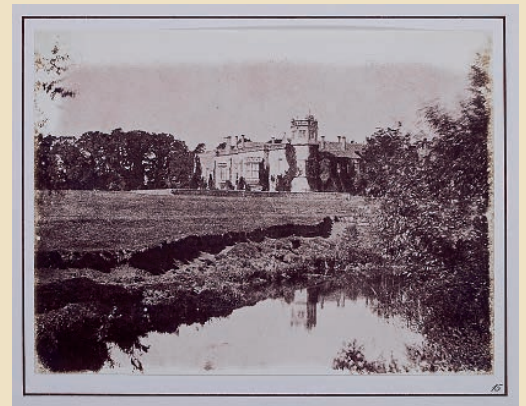
“Lacock Abbey in Wiltshire” by Henry Fox Talbot, c. 1835